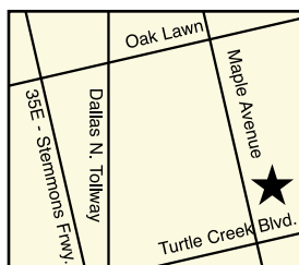
Heritage World Headquarters

THIS AUCTION IS PRESENTED AND CATALOGED BY HERITAGE AUCTIONS, INC.