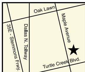
Heritage World Headquarters

THIS AUCTION IS PRESENTED AND CATALOGED BY HERITAGE AUCTIONS, INC.