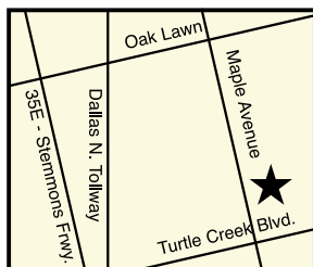
Heritage World Headquarters

THIS AUCTION IS PRESENTED AND CATALOGED BY HERITAGE AUCTIONS, INC.