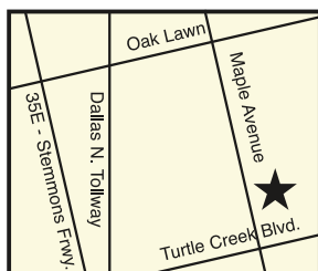
Heritage World Headquarters

THIS AUCTION IS PRESENTED AND CATALOGED BY HERITAGE AUCTIONS, INC.