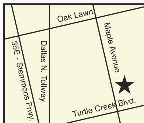
Heritage World Headquarters

THIS AUCTION IS PRESENTED AND CATALOGED BY HERITAGE AUCTIONS, INC.