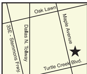
Heritage World Headquarters

THIS AUCTION IS PRESENTED AND CATALOGED BY HERITAGE AUCTIONS, INC.