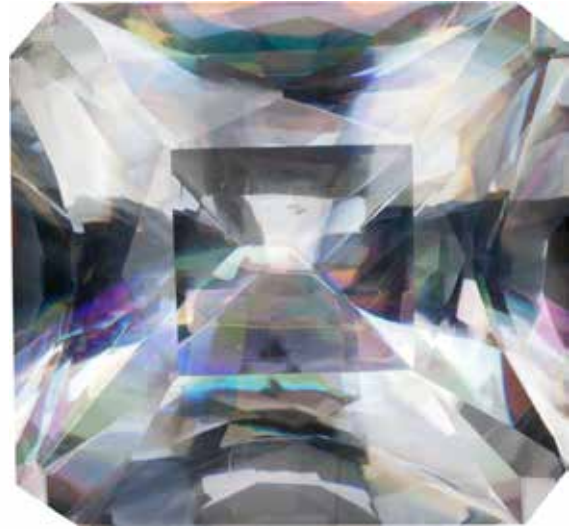
COLLECTOR GEMSTONE: RAINBOW CALCITE - 44.16 CT Brazil Sold for: $3,250