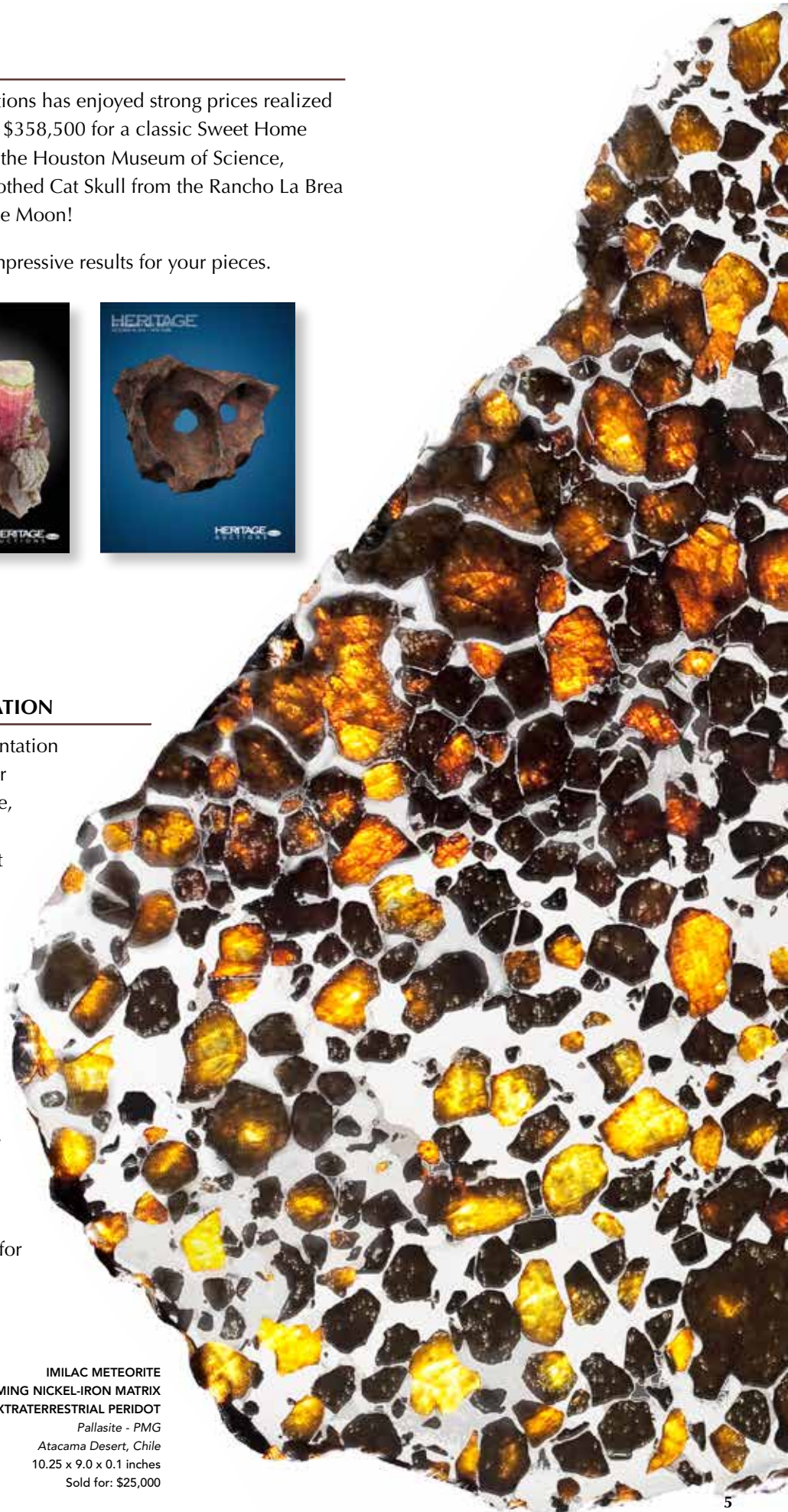
IMILAC METEORITE GLEAMING NICKEL-IRON MATRIX with EXTRATERRESTRIAL PERIDOT Pallasite - PMG Atacama Desert, Chile 10.25 x 9.0 x 0.1 inches Sold for: $25,000

The award-winning catalogs produced for each of our Signature® auctions are second to none: beautifully produced by professional graphic designers with full-color images of each lot composed in detail by professional photographers. The result is a book that is both a gorgeous and collectible auction catalog, and a treasured reference work for students, scholars, and collectors. Such an elaborate presentation will no doubt make you proud and ensure your legacy for generations to come.