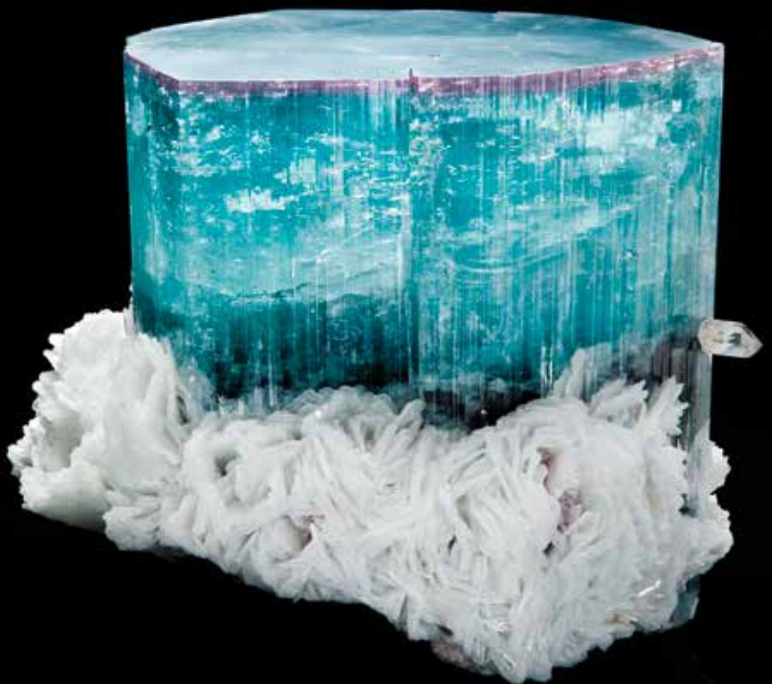
BLUE TOURMALINE WITH RED TOP Paprok, Nuristan Province, Afghanistan 4 1/2 x 4 x 4 1/2 inches Sold for: $83,650

Whatever your situation, whatever your reason, you have one goal: to realize the very best prices for every piece. Heritage Auctions, the largest auction house founded in America, can help you accomplish that.