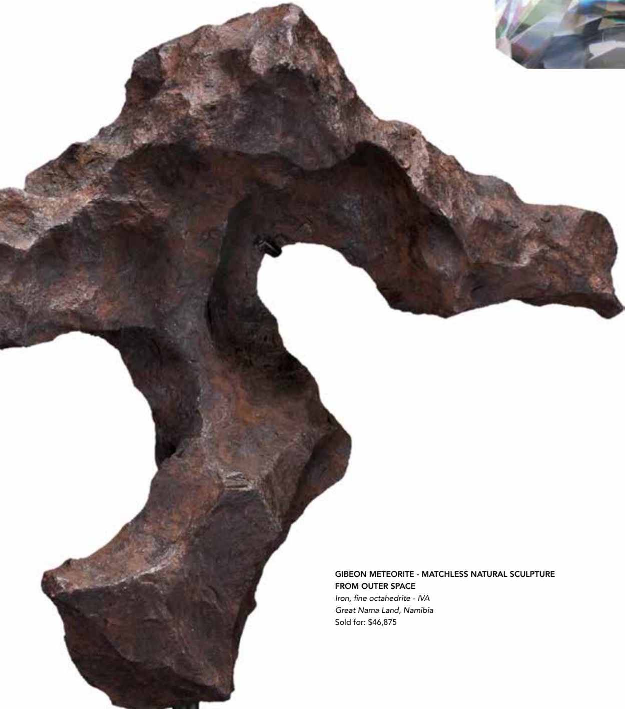
GIBEON METEORITE - MATCHLESS NATURAL SCULPTURE FROM OUTER SPACE Iron, fine octahedrite - IVA Great Nama Land, Namibia Sold for: $46,875