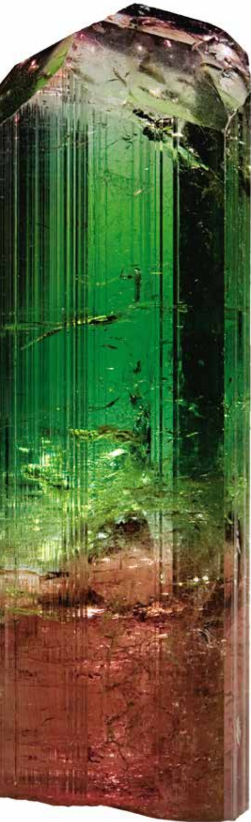
TOURMALINE CRYSTAL Pech, Konar, Nuristan, Afghanistan 2-1/4 x 7/8 inch Sold for: $5,975